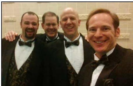
Take a bow, Fellahs!