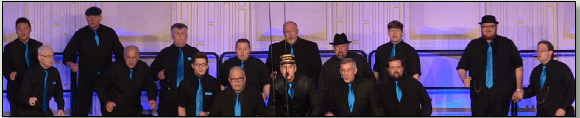
SONS OF THE SEVERN