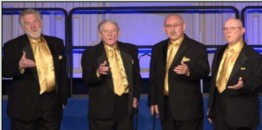
FOUR IN THE MORNING