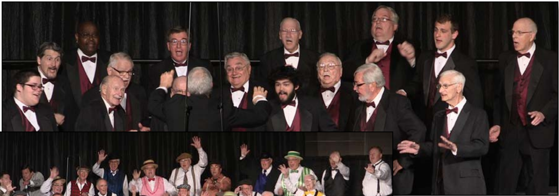
SINGING CEDAR CHORUS