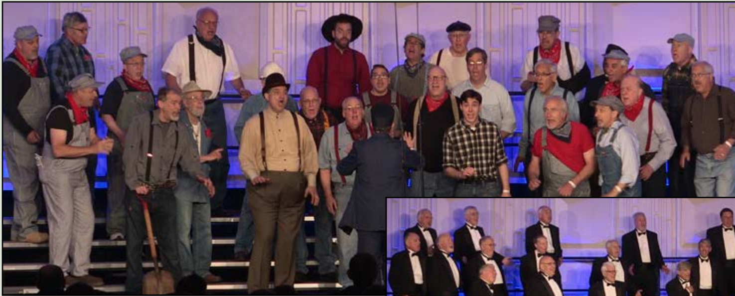
HEART OF MARYLAND

Contest score sheets may be found at http://www.midatlanticdistrict.com/scores