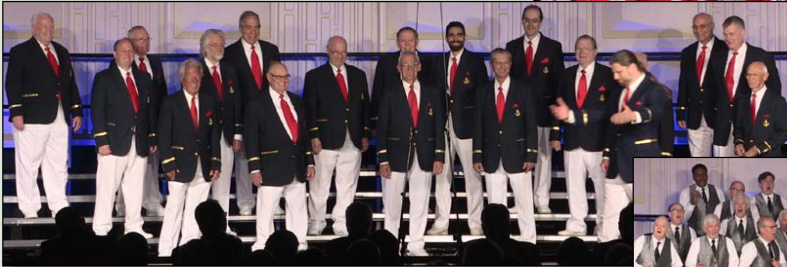
C HORUS OF THE ATLANTIC