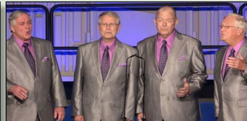
YOUTH RECLAMATION PROJECT