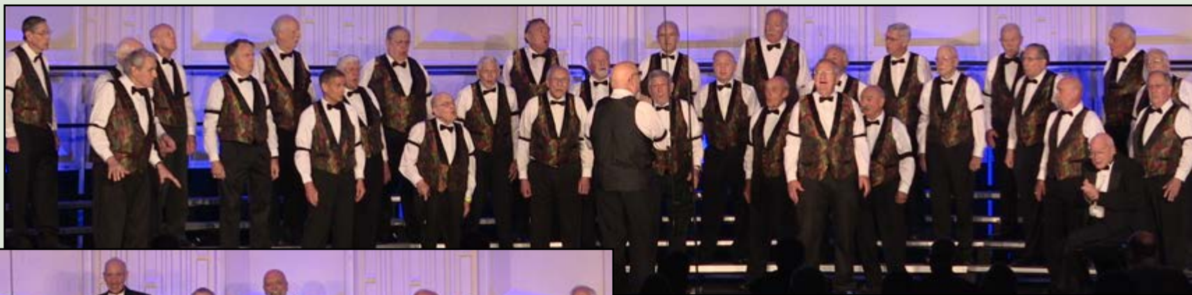
HARMONY HERITAGE SINGERS (MIC TESTERS)