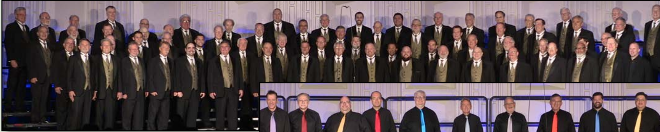
THE BROTHERS IN HARMONY