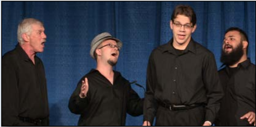
JUST PRESS PLAY