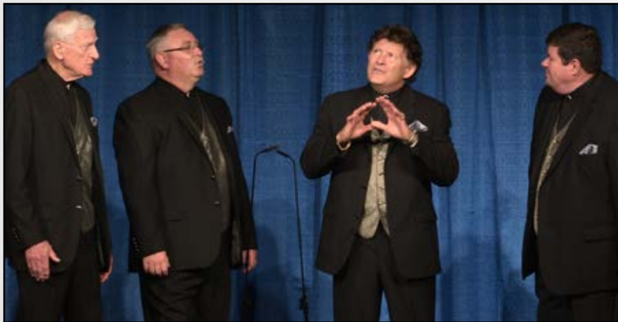
3rd PLACE MEDALIST Distinction