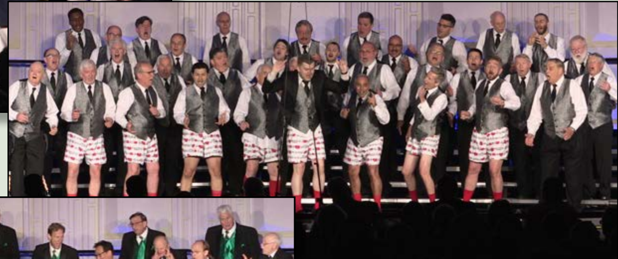
MORRIS MUSIC MEN