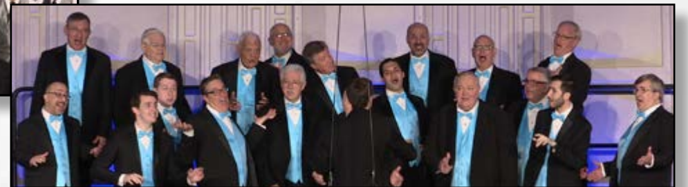
MOST IMPROVED DAPPER DANS OF HARMONY