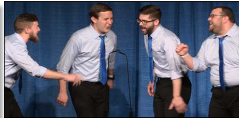
BREAK FROM BLUE COLLAR