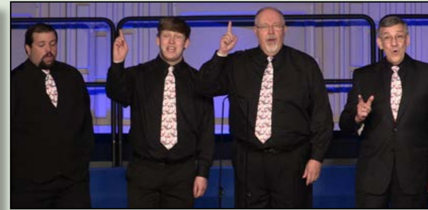
MEN OVER CHORD