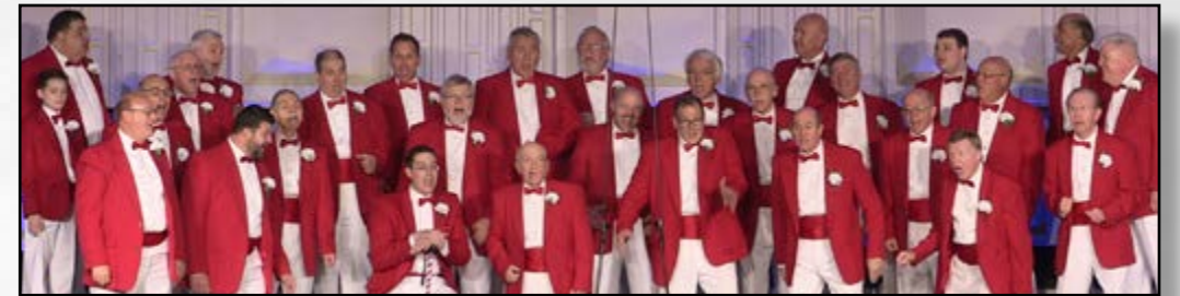
PLATEAU AAA WINNER HUNTERDON HARMONIZERS