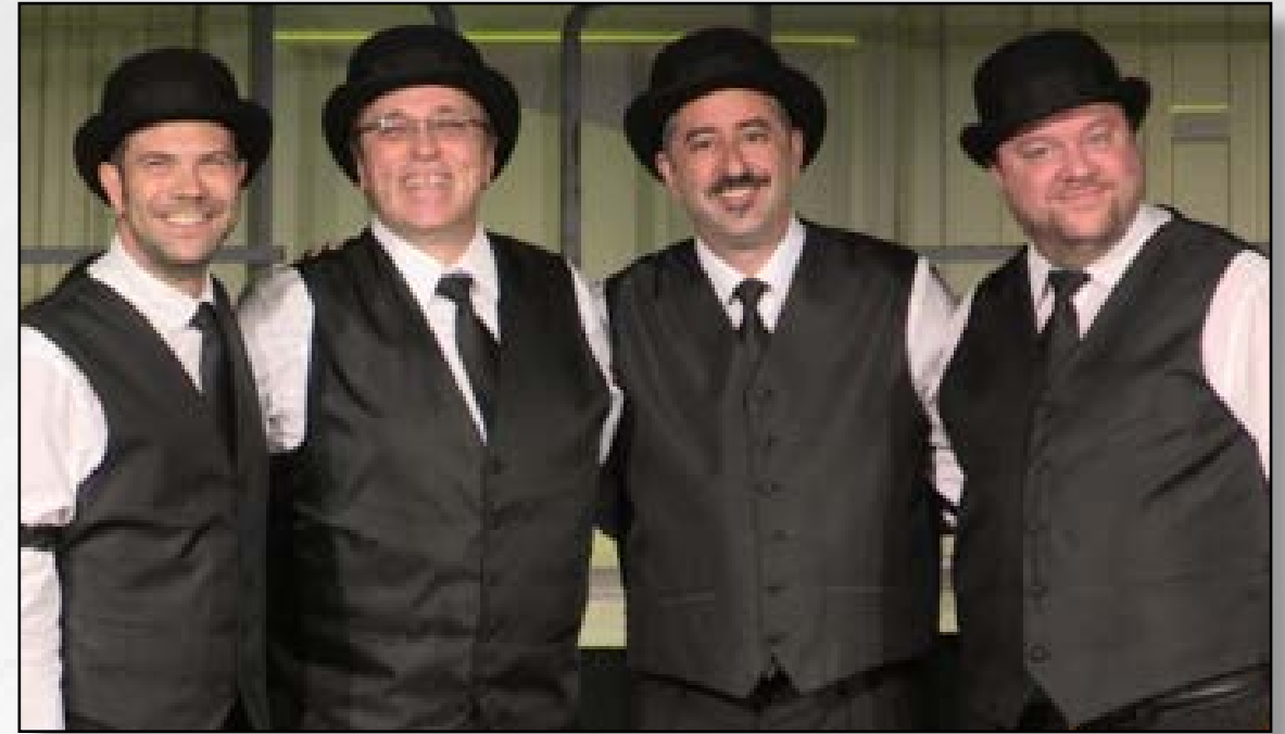
2nd PLACE MEDALIST 29 Seconds