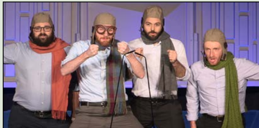
AGE OF FLIGHT