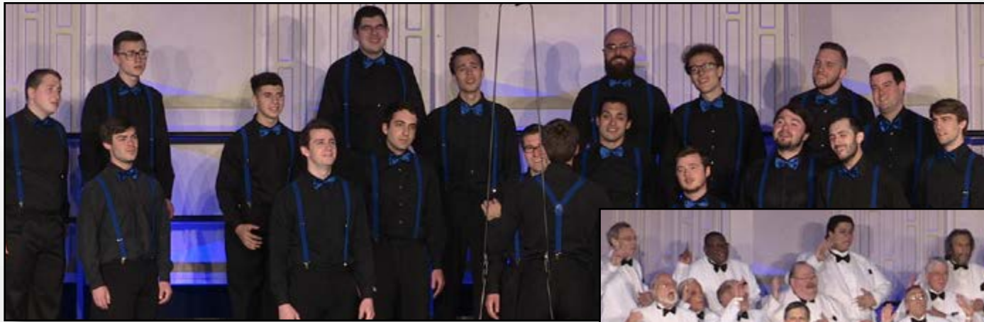
NORTHERN DIVISION EAST COAST SOUND & Plateau AAAA winner EAST COAST SOUND