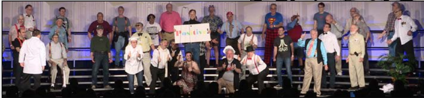
THIRD PLACE MEDALIST WESTCHESTER CHORDSMEN