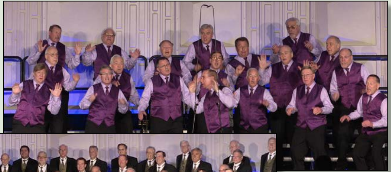
BERGEN COUNTY BLUE CHIP CHORUS