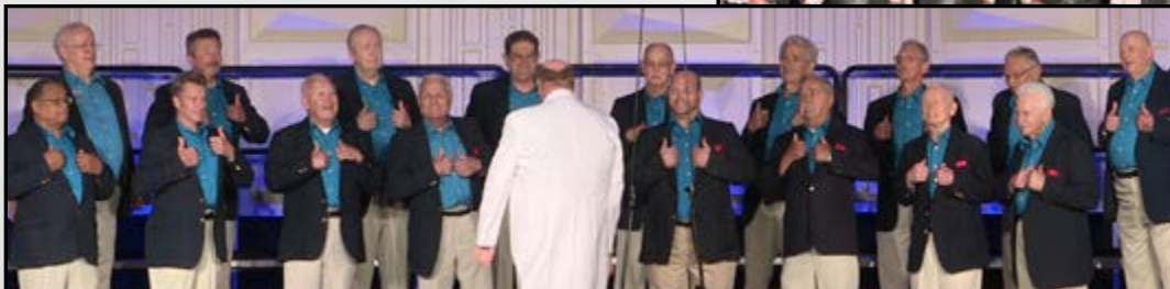
PLATEAU A WINNER - BOARDWALK CHORUS