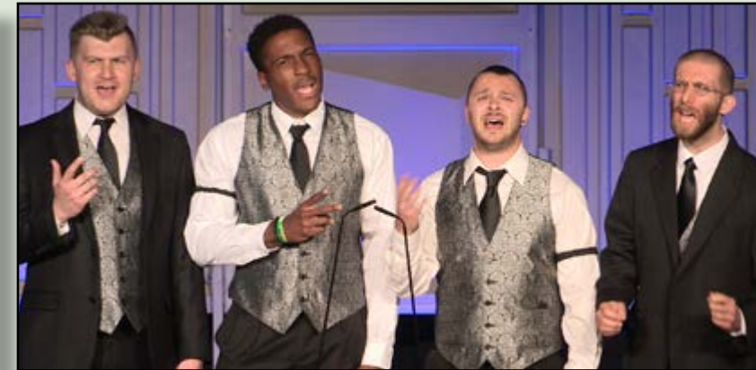
NAPOLEON AND THE BONAPARTES