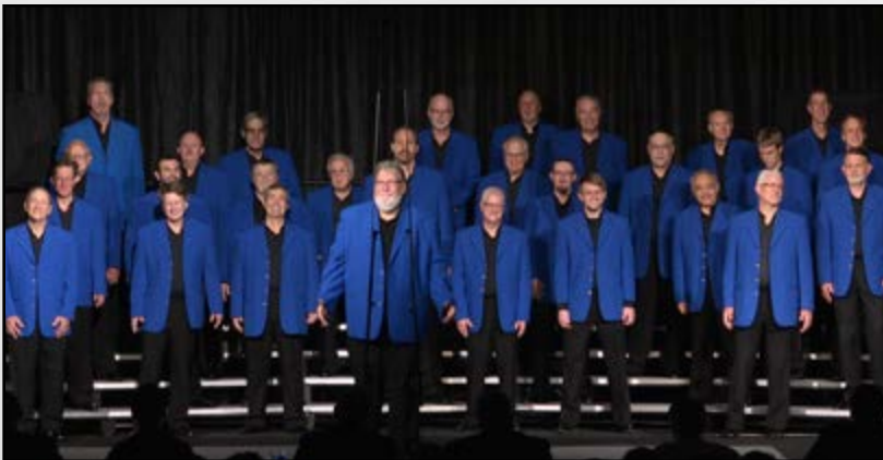
Plateau AAA Winner THE MAINLINERS