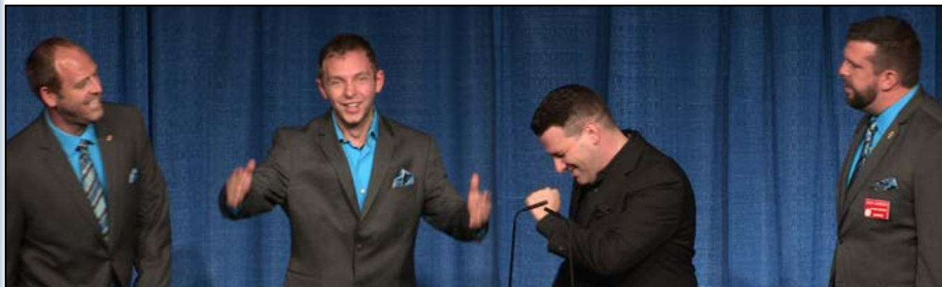
ROUTE 1 (MIC COOLERS)