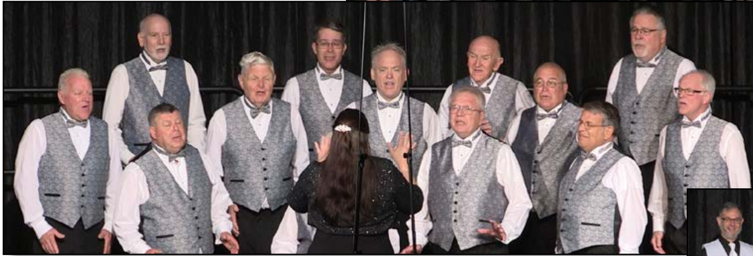
FIRST STATE HARMONIZERS