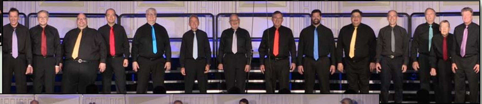
JERSEY HARMONY EXPRESS