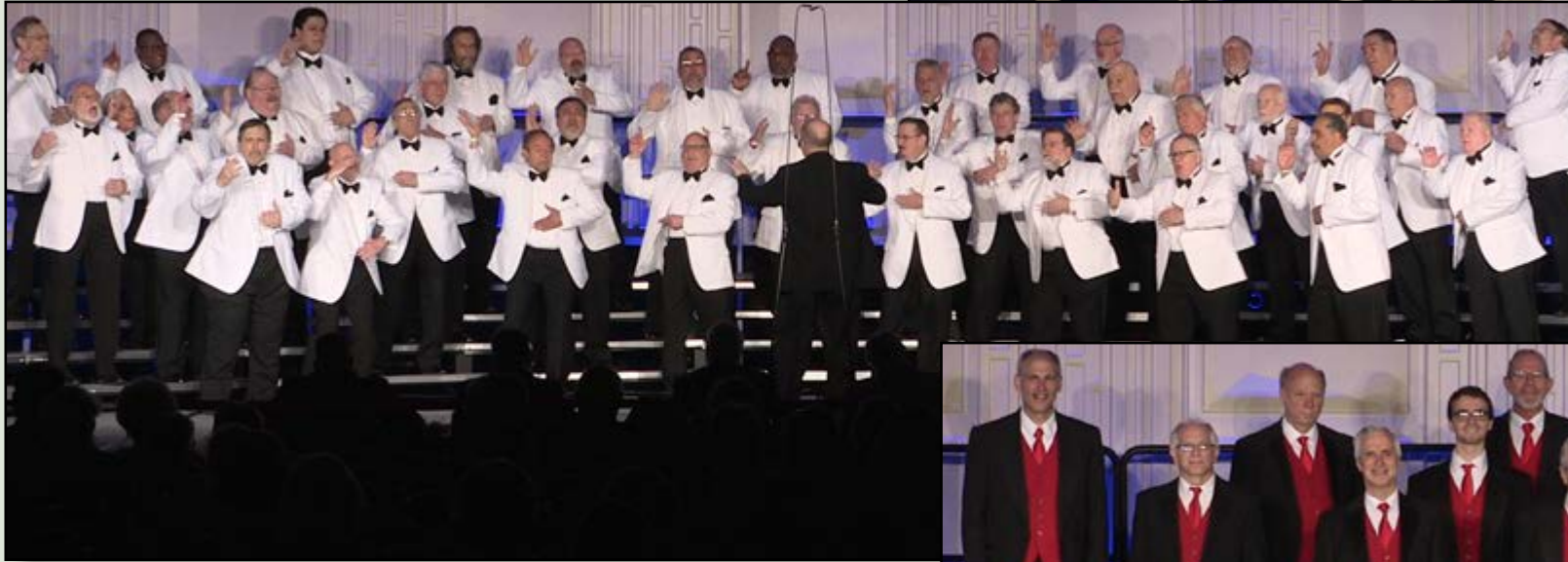
THE BIG APPLE CHORUS