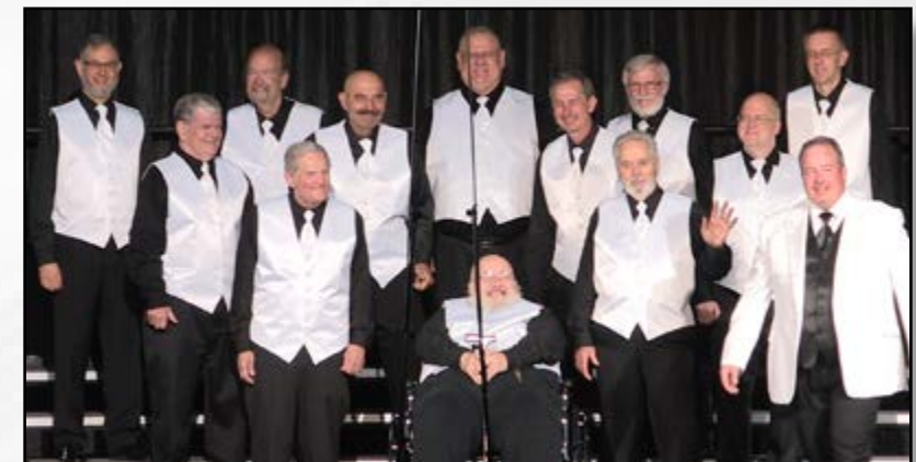
Plateau A Winner WHITE ROSE CHORUS