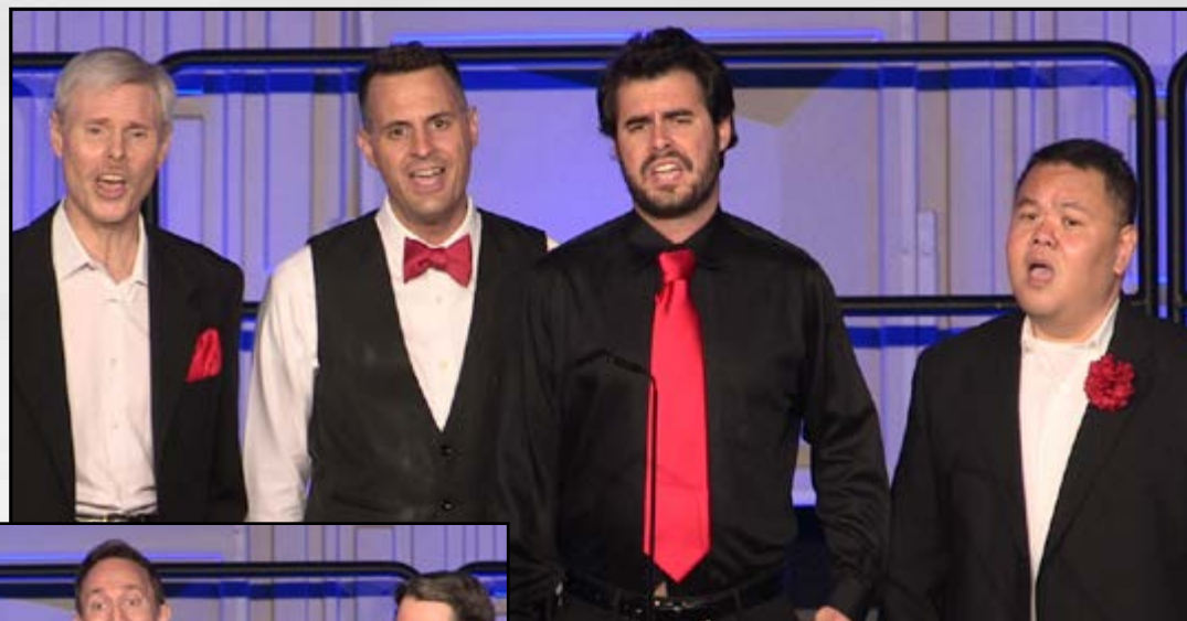
SOUTHERN DIVISION CHAMPIONS Capital City Close Harmony Club

The reunited Shameless quartet medaled in third place – with that