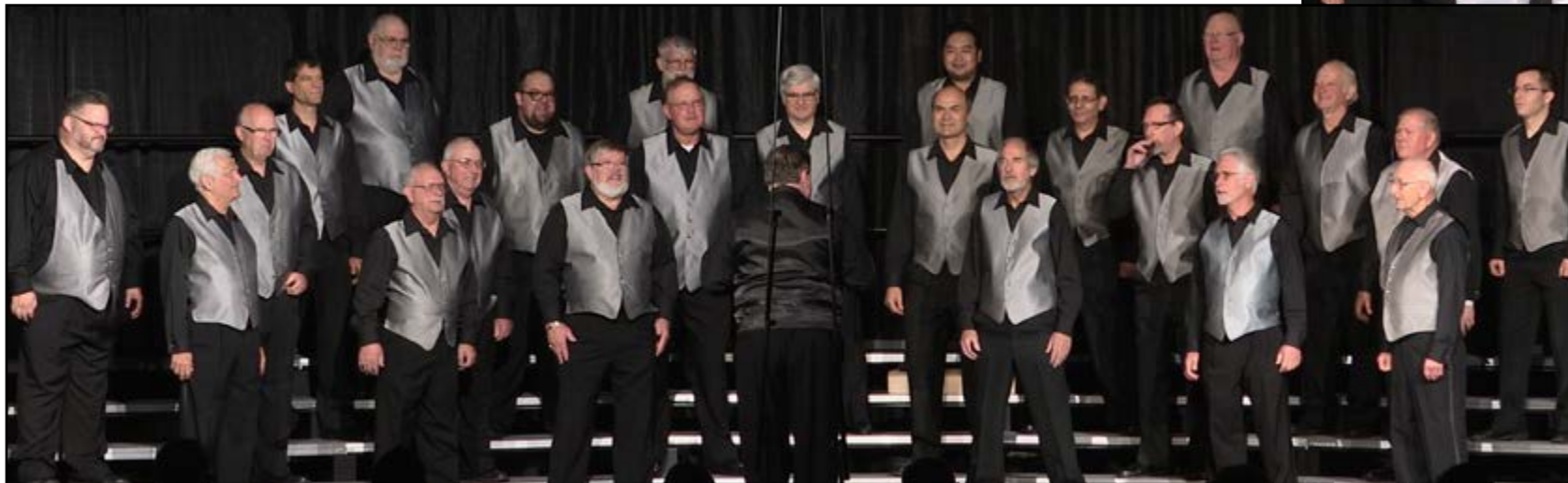
KEYSTONE CAPITAL CHORUS

Check out the many, many more Division Convention photos at http://www.midatlanticdistrict.com/photos