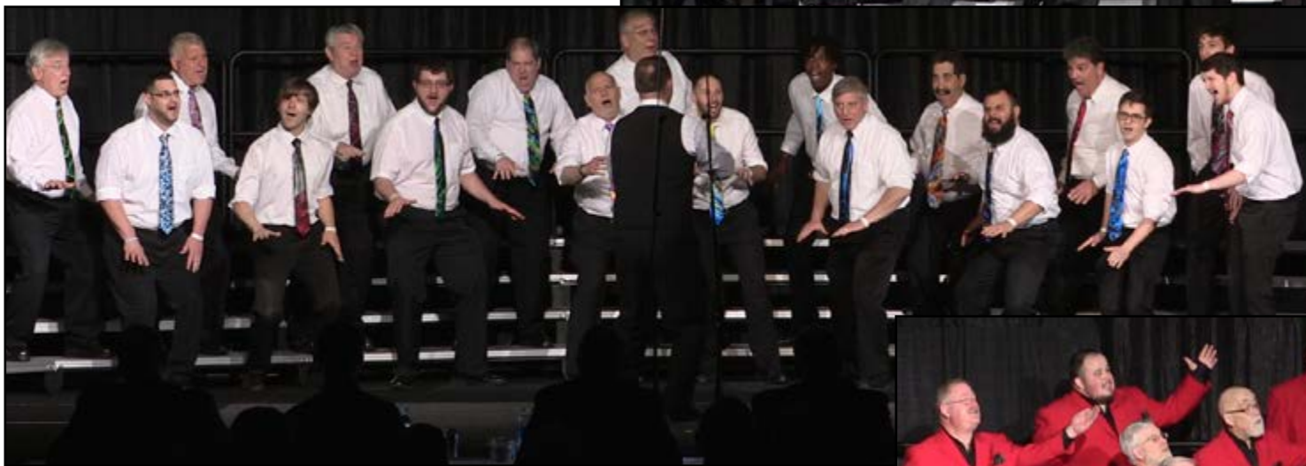
LONG ISLAND SOUND