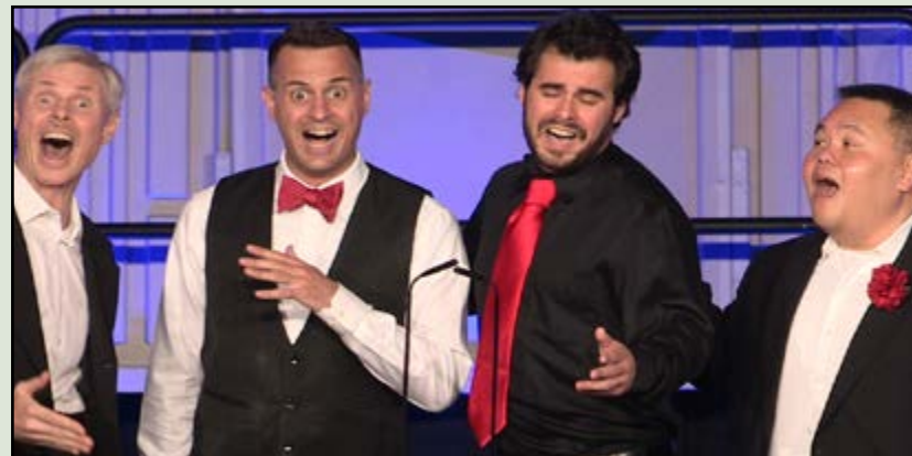
CAPITAL CITY CLOSE HARMONY CLUB