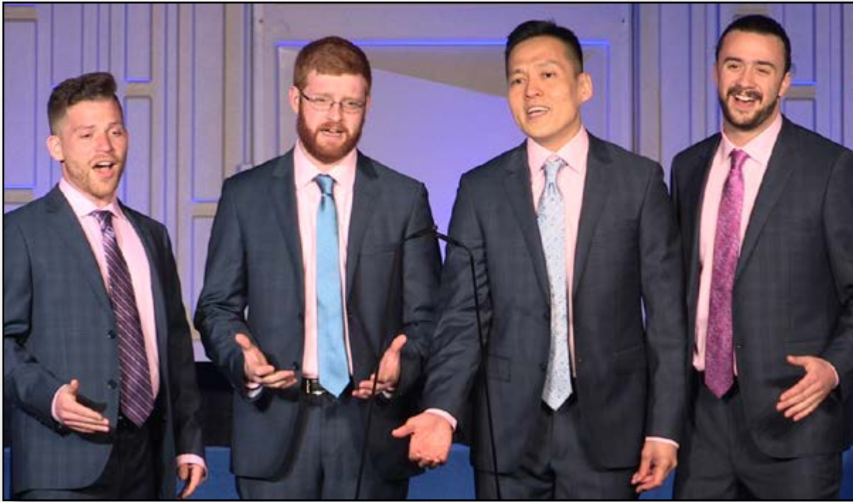
NORTHERN DIVISION QUARTET CHAMPIONS Madhattan