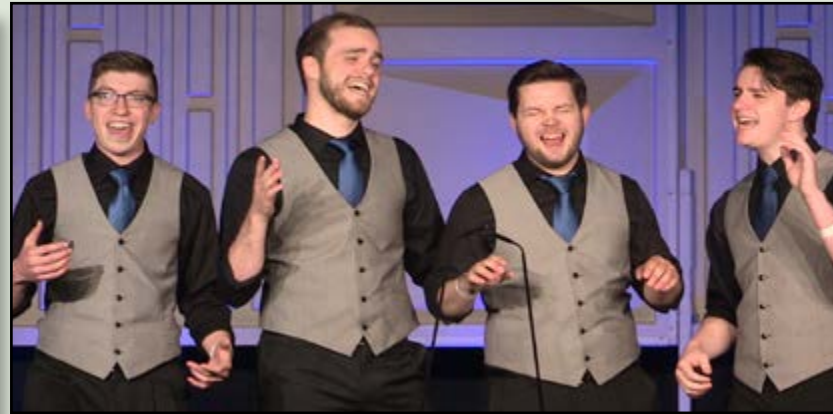
BROTHERS IN ARMS