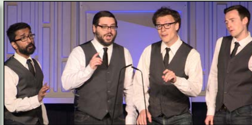
PARK SLOPE FOUR