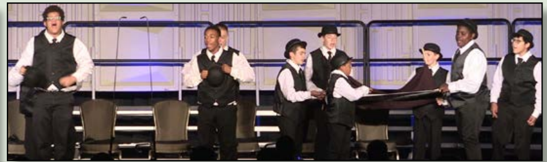
WILDCAT HARMONIZERS (MIC COOLERS)