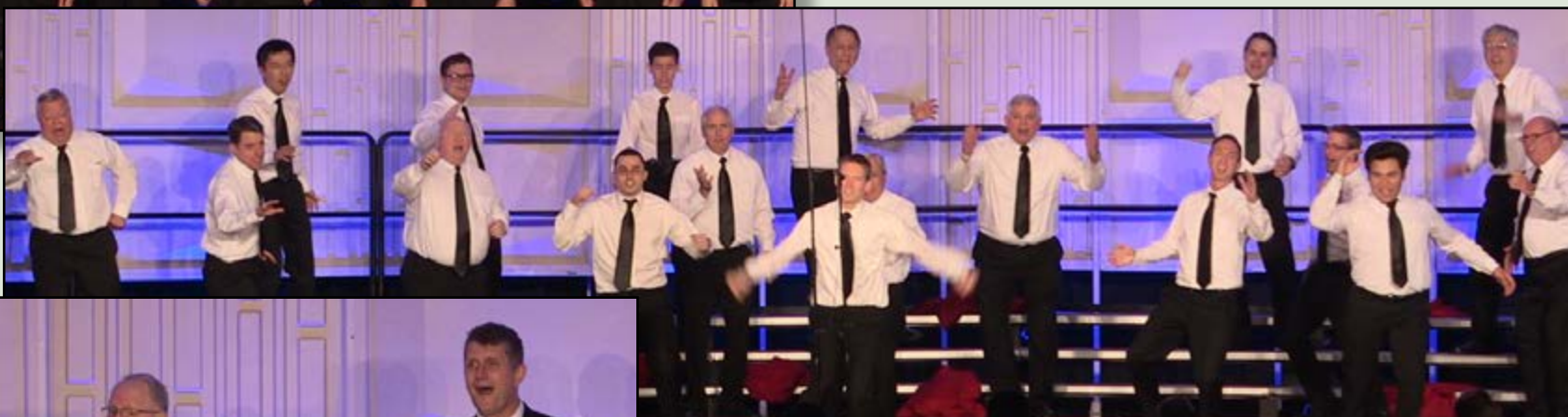
OLD DOMINION CHORUS