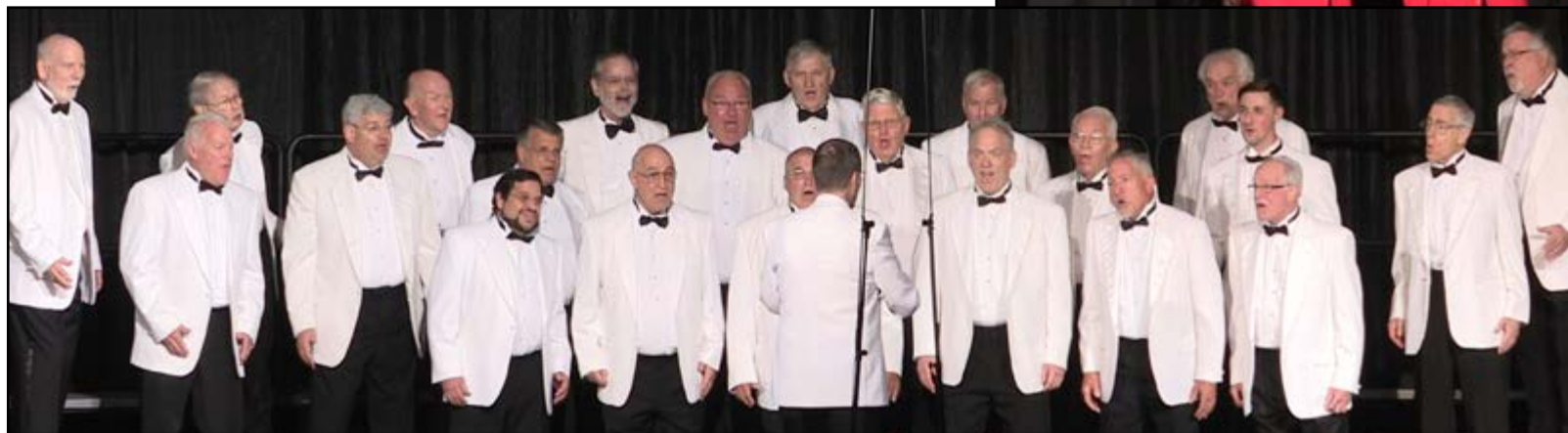
PRIDE OF DELMARVA