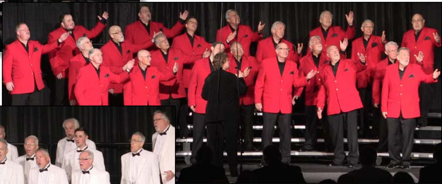
LANCASTER RED ROSE