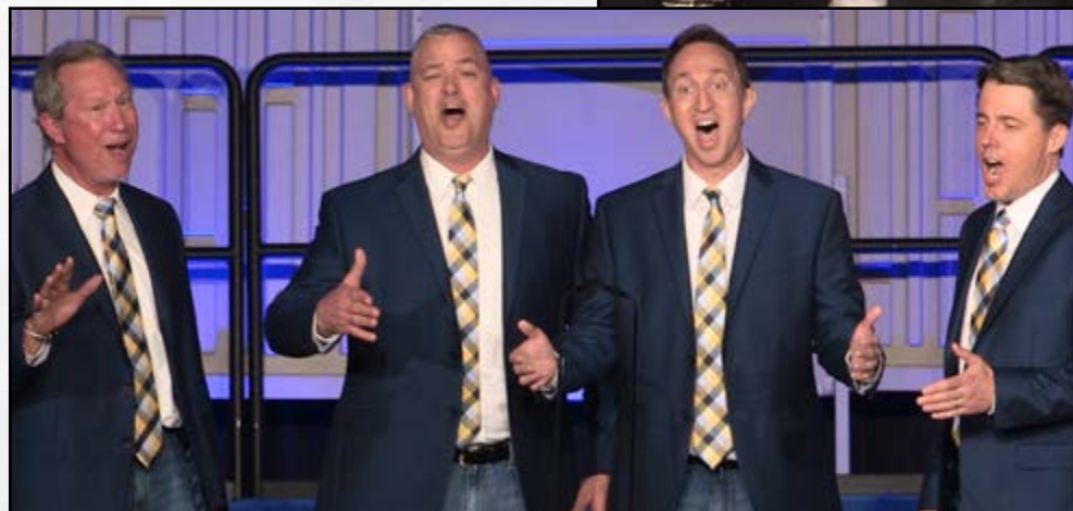
2nd PLACE MEDALIST