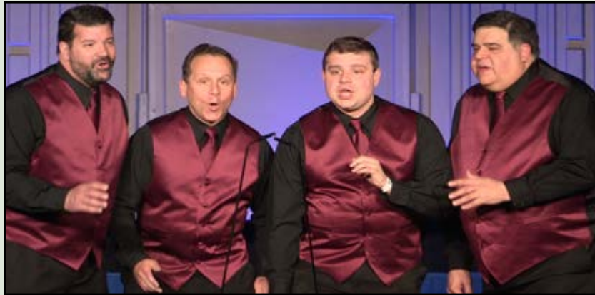
ADHD - A DEFINITE HARMONY DISORDER