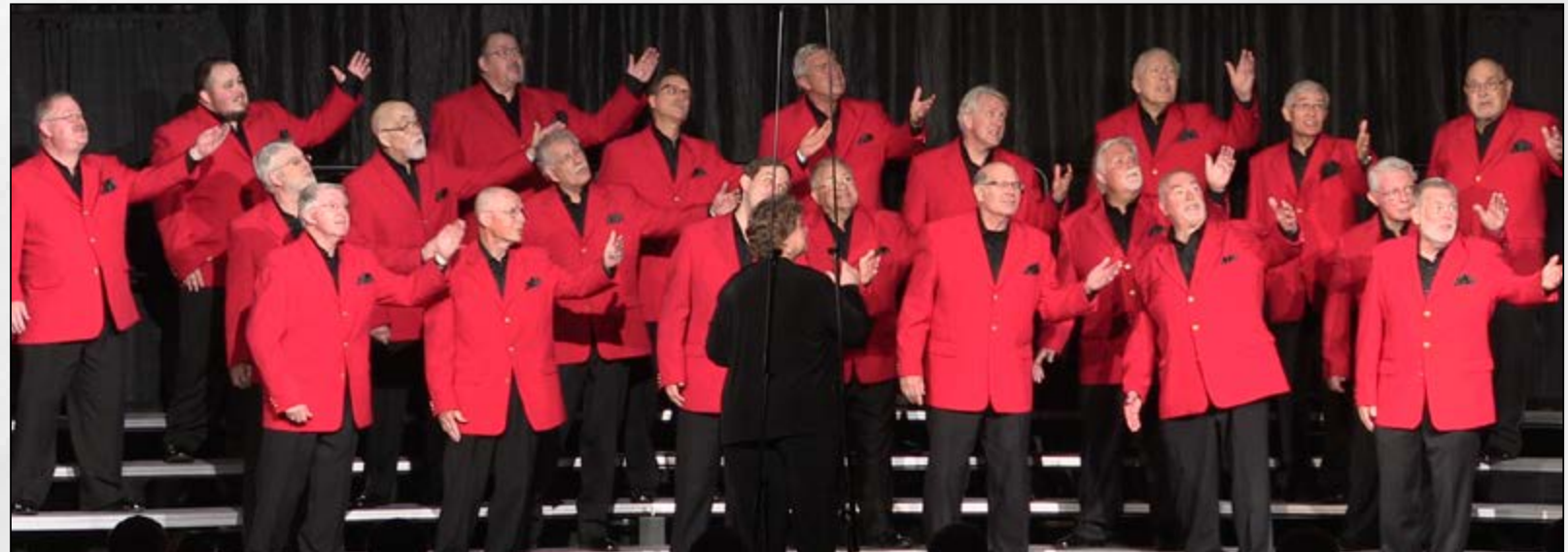
MOST IMPROVED CHORUS LANCASTER RED ROSE