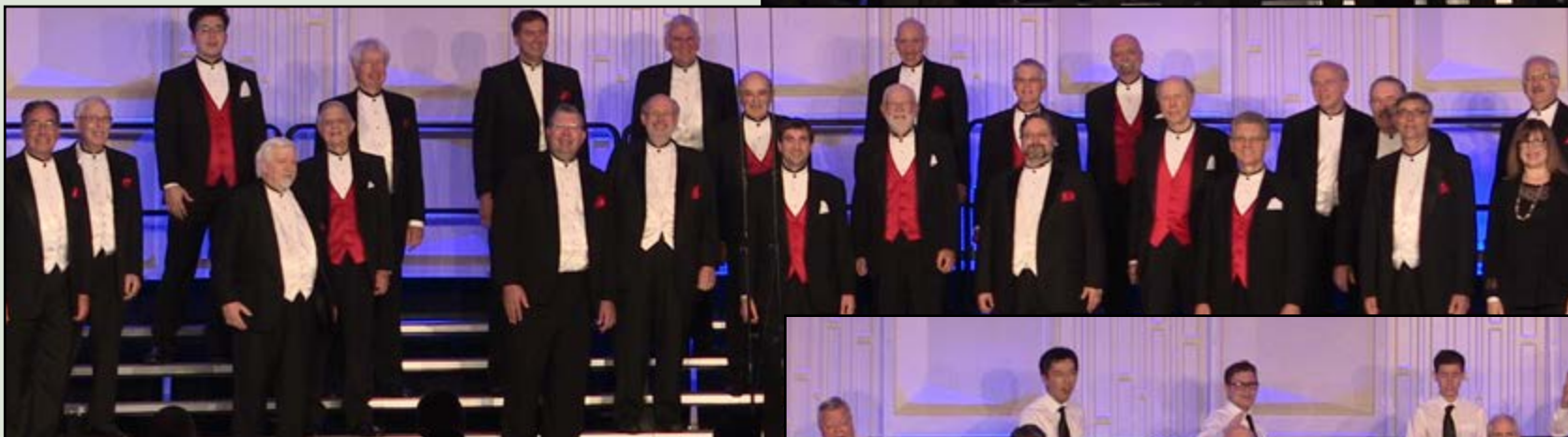
SINGING CAPITAL CHORUS