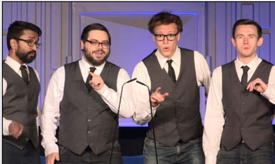
3rd PLACE MEDALIST Park Slope Four