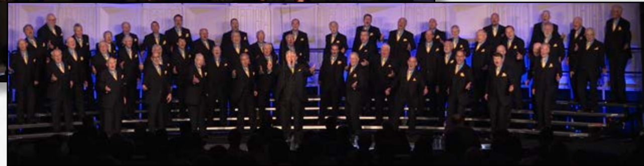
2nd PLACE MEDALIST & Plateau AAA winner THE VIRGINIANS

See SOUTHERN CONVENTION, continued on next page