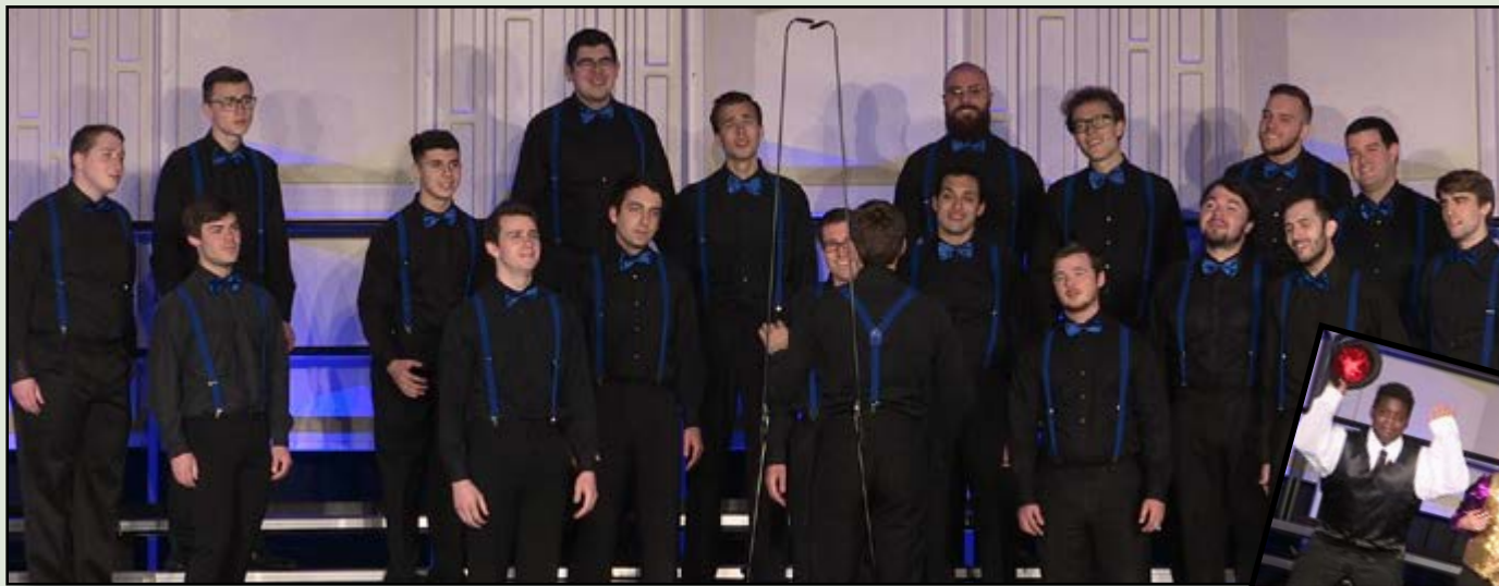
EAST COAST SOUND