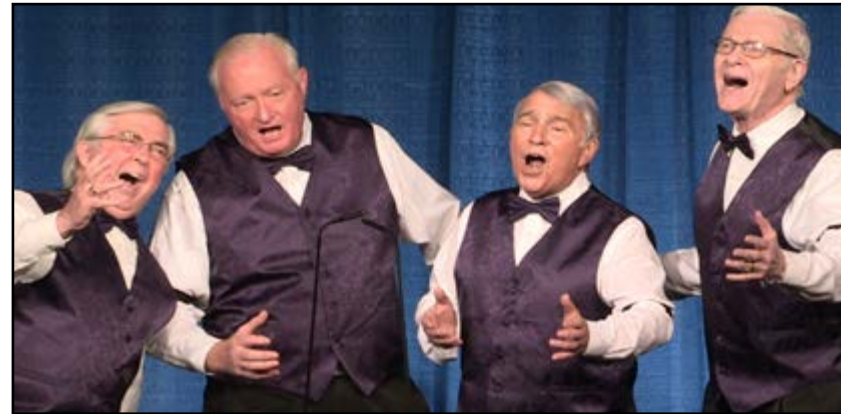
BAY BRIDGE CONNECTION