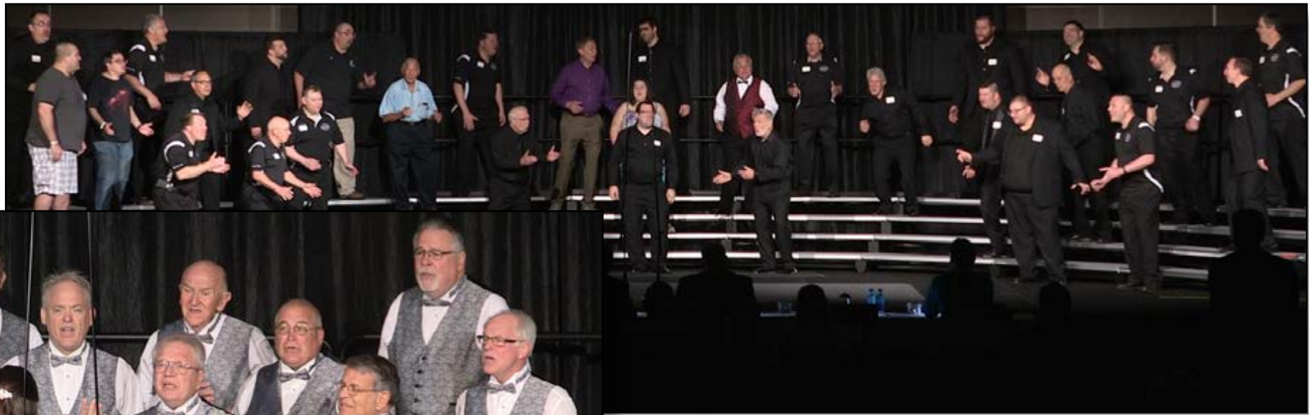
PARKSIDE HARMONY (MIC TESTERS)