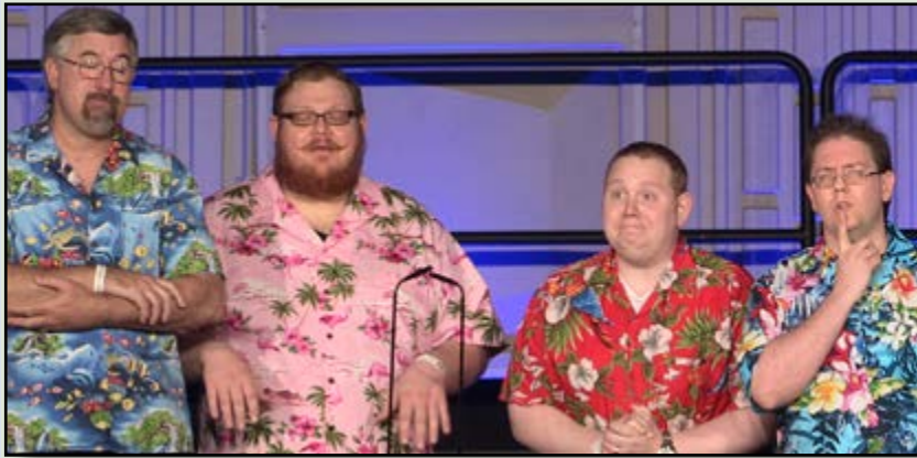
TAGS TO PITCHES