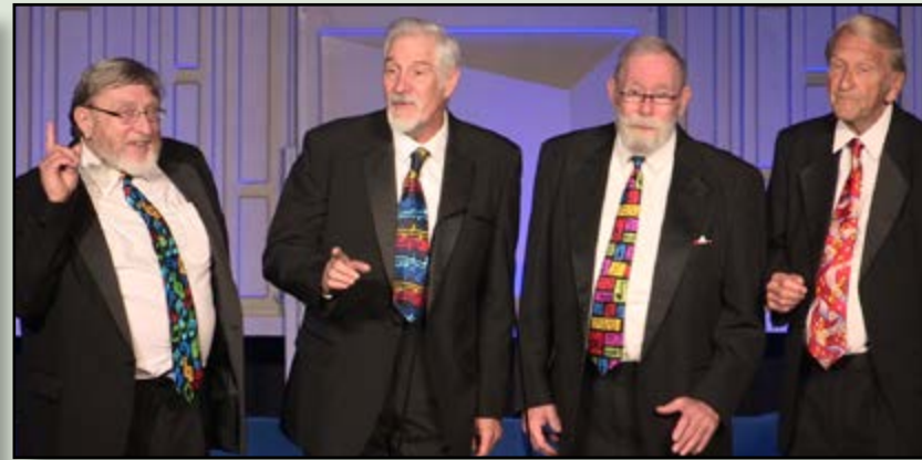
SONGS FOR UNIVERSITY