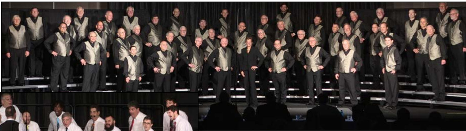
THE NORTH PENNSMEN

Contest score sheets may be found at http://www.midatlanticdistrict.com/scores