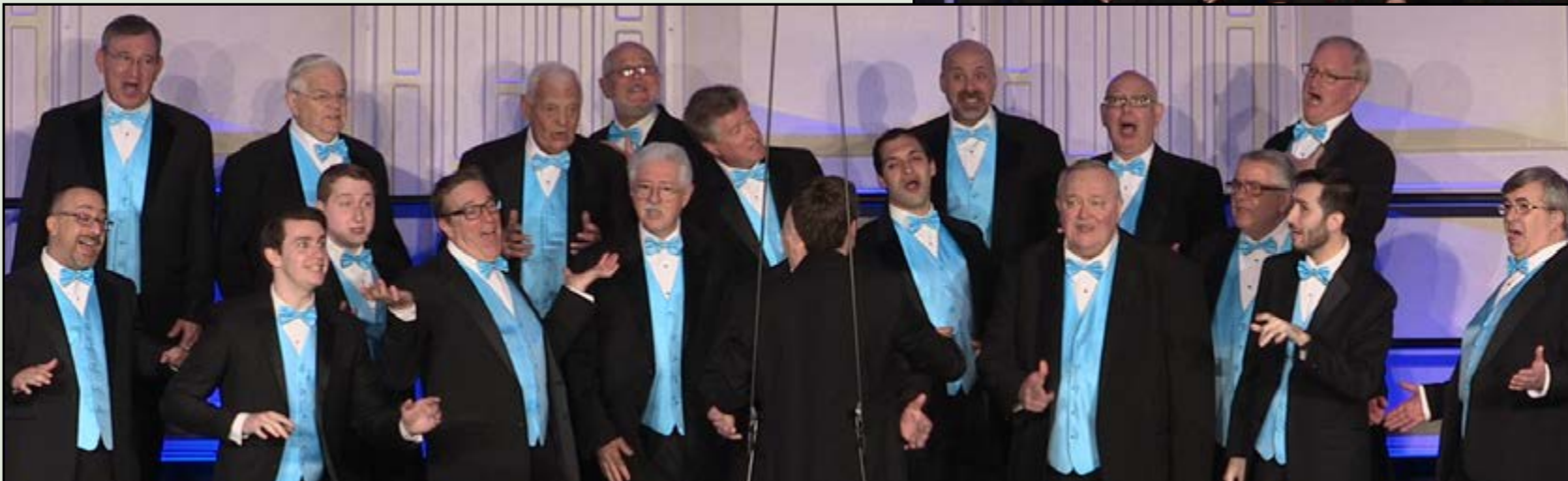
THE DAPPER DANS OF HARMONY

Check out the many, many more Division Convention photos at http://www.midatlanticdistrict.com/photos