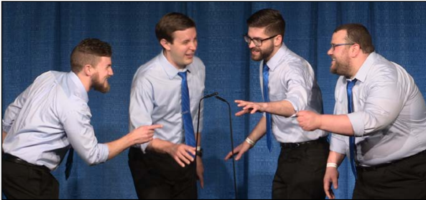
CENTRAL DIVISION CHAMPIONS Break From Blue Collar