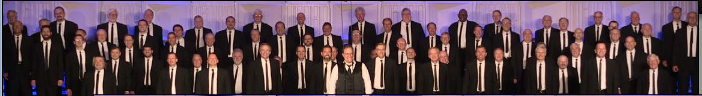
THE OLD LINE STATESMEN