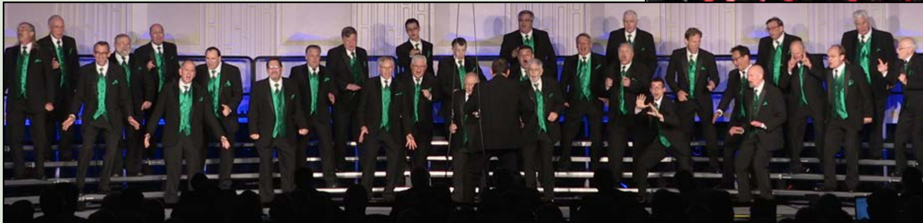
THE PINE BARONS

Check out the many, many more Division Convention photos at http://www.midatlanticdistrict.com/photos