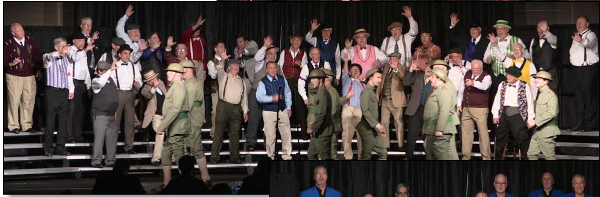
CHORUS OF THE CHESAPEAKE