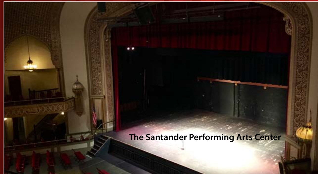
The Santander Performing Arts Center

The Santander Performing Arts Center in Reading, Pa. was built in the 1870s as a market, with a Masonic Temple on its upper floors. It became the Academy of Music in 1886. The Rajah