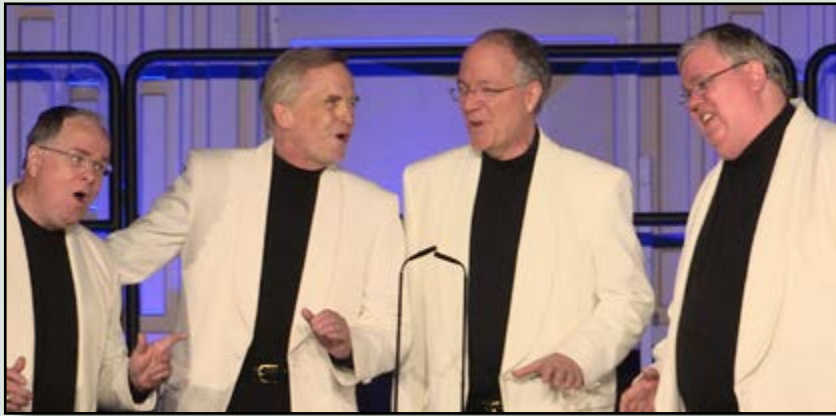
OLD TOWN SOUND