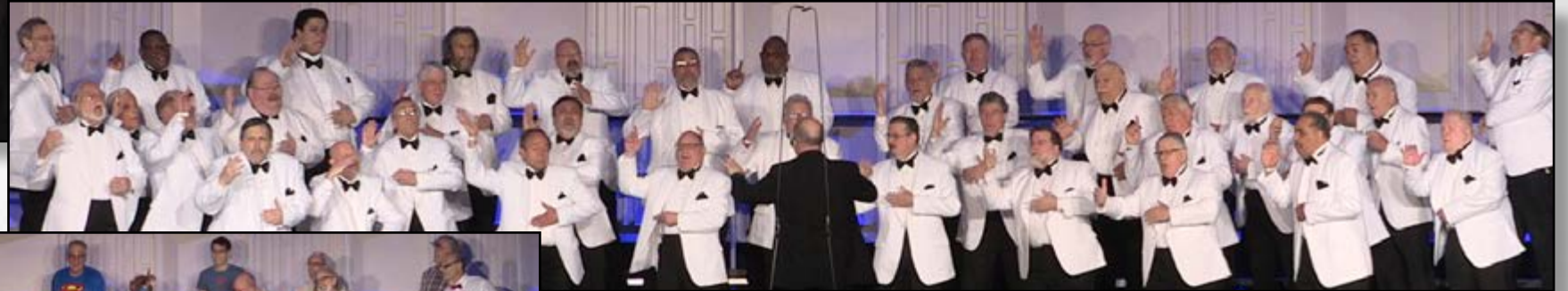
2nd PLACE MEDALIST THE BIG APPLE CHORUS