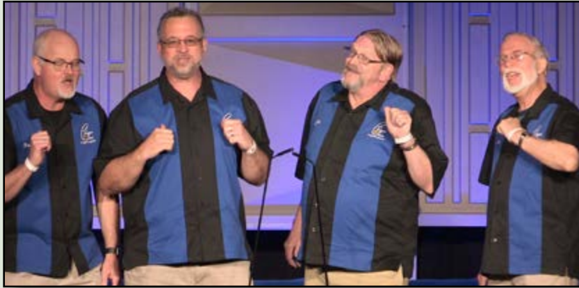
TONGUE IN CHEEK