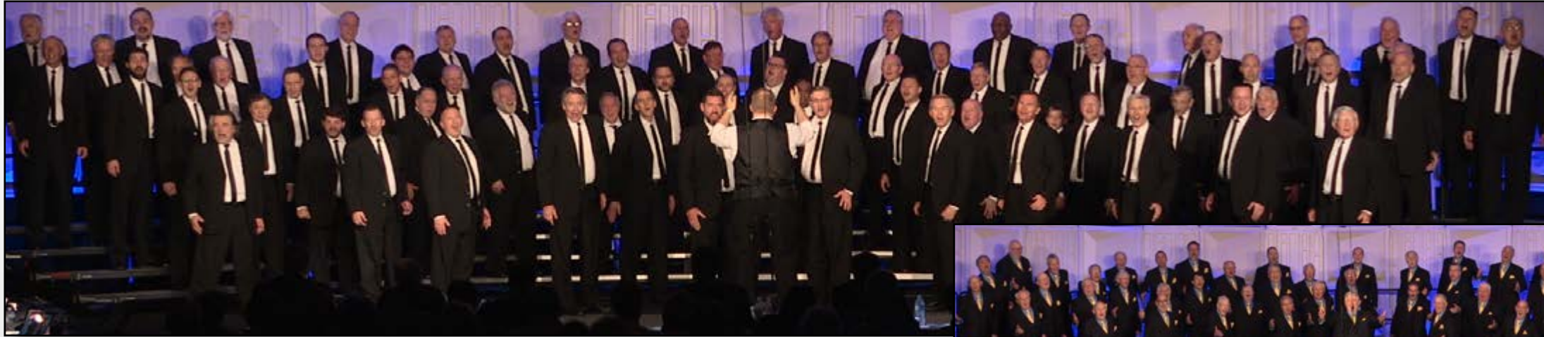
SOUTHERN DIVISION CHORUS CHAMPION & Plateau AAAA winner ALEXANDRIA HARMONIZERS