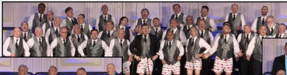
PLATEAU AA WINNER MORRIS MUSIC MEN