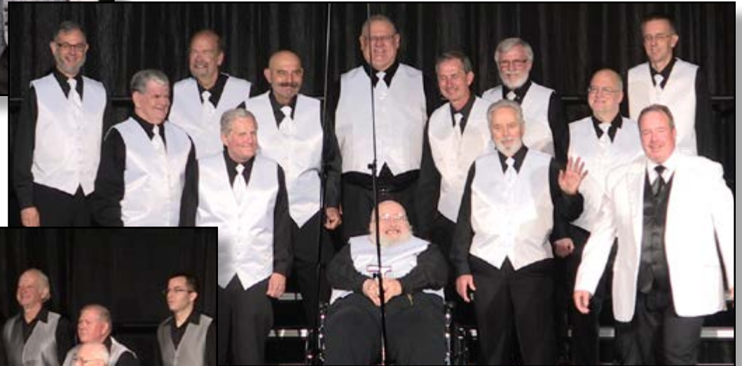
WHITE ROSE CHORUS