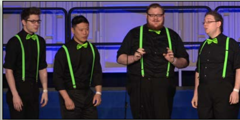
SPLASH OF LIME