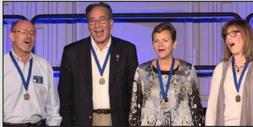
SERENDIPITY (MAD MV CHAMPS) MIC TESTER