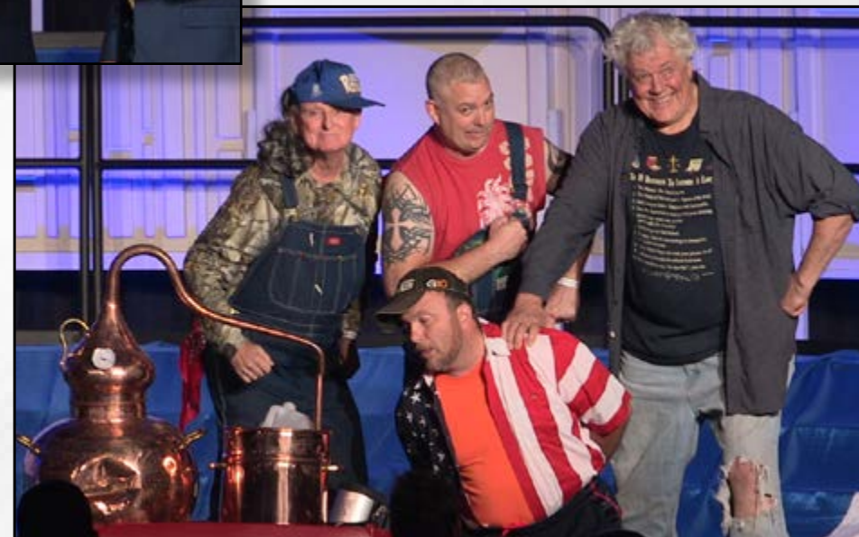
3rd PLACE MEDALIST