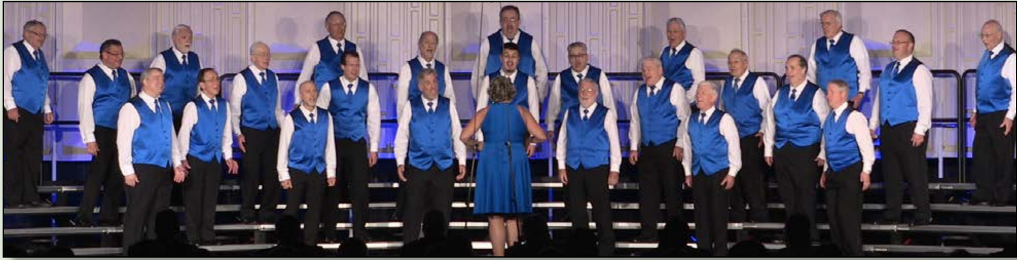
BUCKS COUNTY COUNTRY GENTLEMEN

Check out the many, many more Division Convention photos at http://www.midatlanticdistrict.com/photos