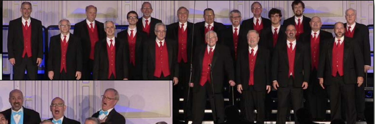
LEHIGH VALLEY HARMONIZERS