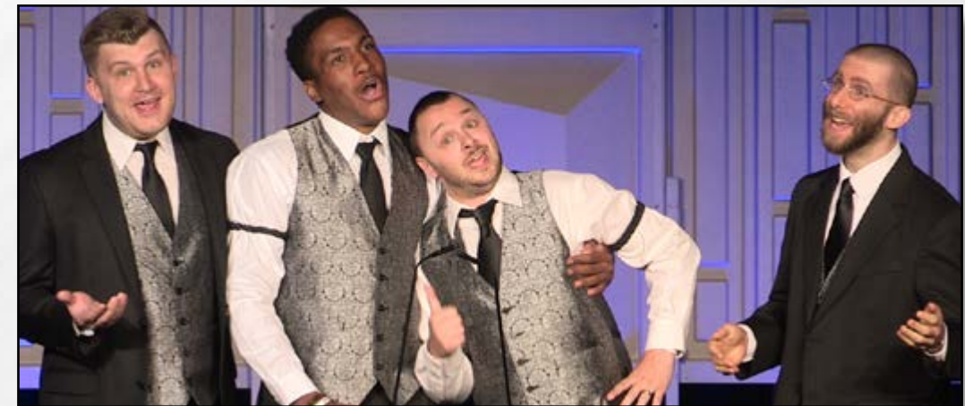
MAD Novice Quartet Champion Napoleon and the Bonapartes