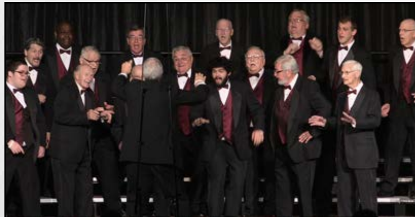
Plateau AA Winner SINGING CEDAR CHORUS