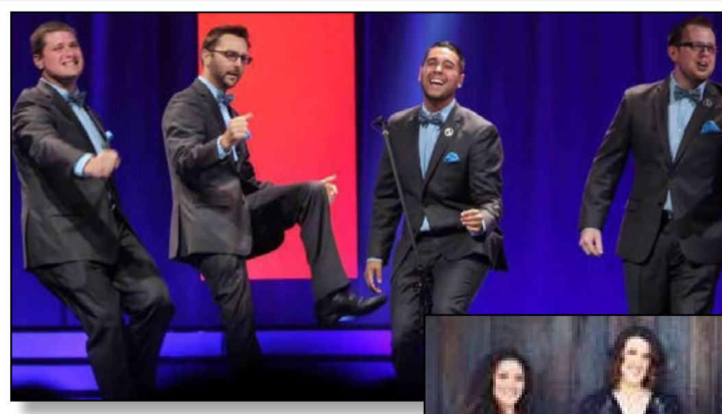
Promoting barbershop harmony...

Caldwell and Montclair sponsor Jerrey Harmony Explosion!